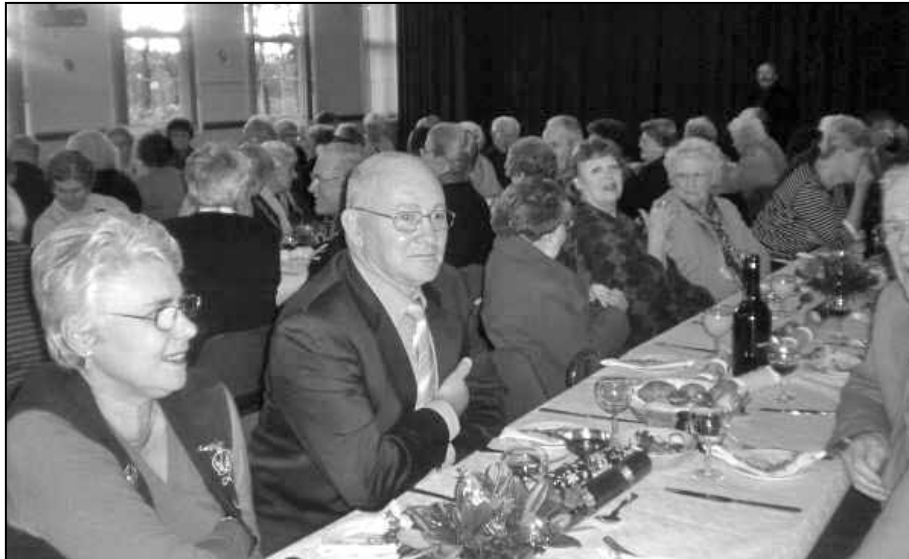
Residents of Dawley Hamlets enjoying the Parish Christmas Party 2008

Following the continuing success of the Parish Senior Citizen's Christmas meal the Parish Council would like to provide a similar social occasion in the summer for residents of Dawley Hamlets who are of pensionable age.